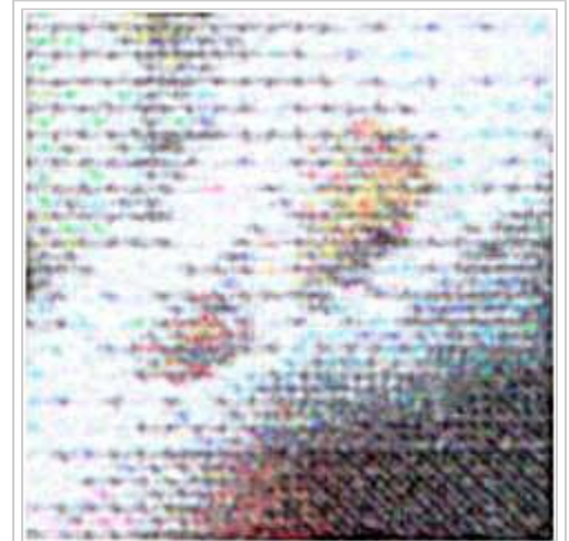
A close-up of the dots produced by an inkjet printer at draft quality. Actual size is approximately 0.25 inches square (0.635 centimetres square). Individual coloured droplets of ink are visible; this sample is about 150 DPI.